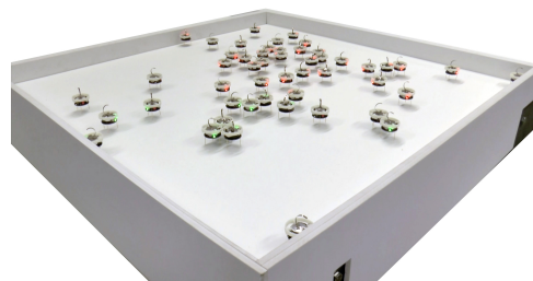
Fig. 3. We tested the most resilient methods on a swarm of 50 Kilobots with 5 contrarians.

contrarians ( m = 10\% of S ). The results were in agreement with the simulations.